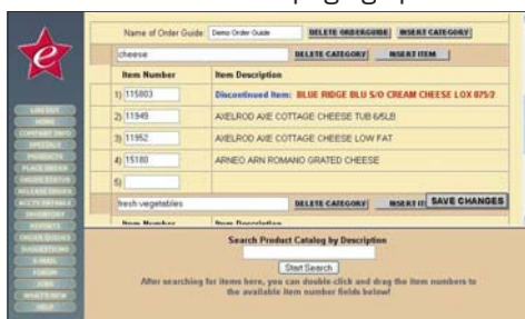
A more "user-friendly" interface for Order Guides!

In Place Order and Inventory, you may view your Order Guide with a pre-determined number of items per page. This paging option is similar to the paging in the Reports section and allows for quick load times for customers with slower internet connections.